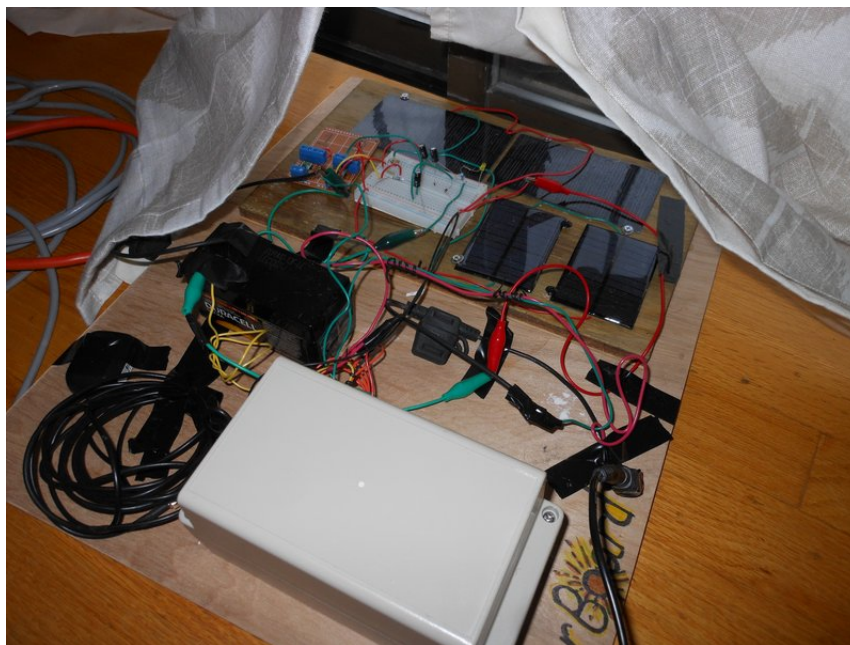
Figure 4: Board in the Window