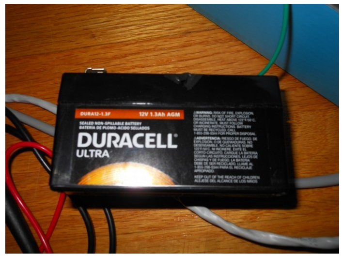
Battery is made in China somewhere (where???), and distributed by Ascent Battery Supply, LLC in Wisconsin.

See the below graph. Although the data cuts out (I knocked out by accident, the adc line into +) you can see a steady self discharge. The current meter used here is not sensitive enough to register the max of 10mA that is charging the battery (used a sparkfun breakout for an ACS712, of 5A current meter) but it may show a slight increase when the battery is increasing. How much self discharge do lead batteries have? We are going to test this particular battery and find out exactly how it performs.