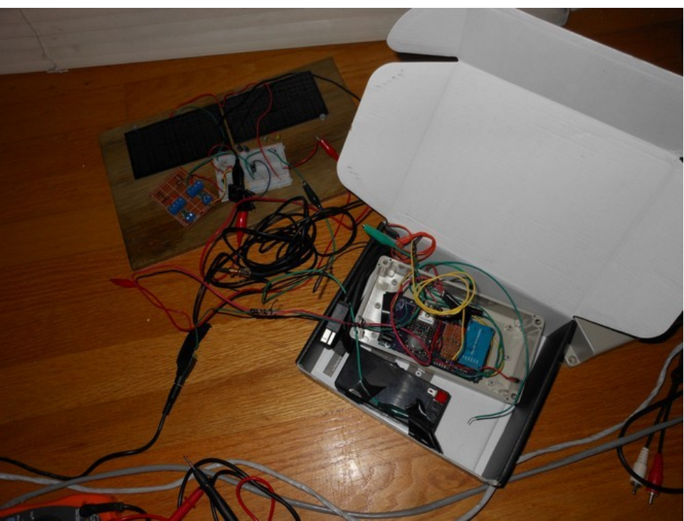
Windmill Data Logger was used with a 12V 1Ah battery. The Regulator used is a somewhat low power AP2204K-ADJTRG1, set to 13.7 or 13.8V (a float voltage for Lead Acid batteries I believe).

Objective: Test out a KISS battery and solar panel, having the panel charge the battery. Log.