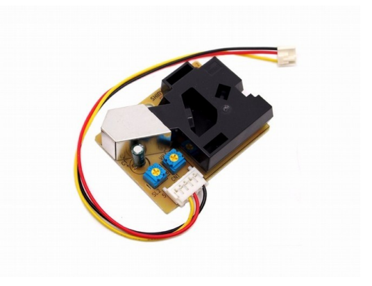
Figure 1: Shinyei PPD42NS Air Quality