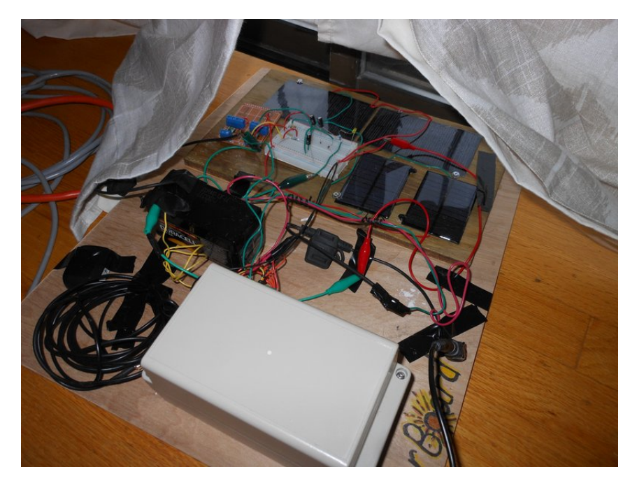
Figure 4: Board in the Window