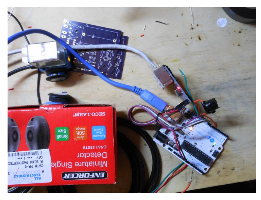
Figure 1: Testing the Sick IR Diode Tripwire

Figure 1 shows two things, first off a diode connected in series with the output of the Sick sensor, and also the orange LED on the top of the sensor. The orange led will be green when there is no connection between the diodes and orange when the Diodes (or LEDs) are lined up correctly. When someone moves across the field of their vision, the orange LED will change to green.<sup>1</sup>