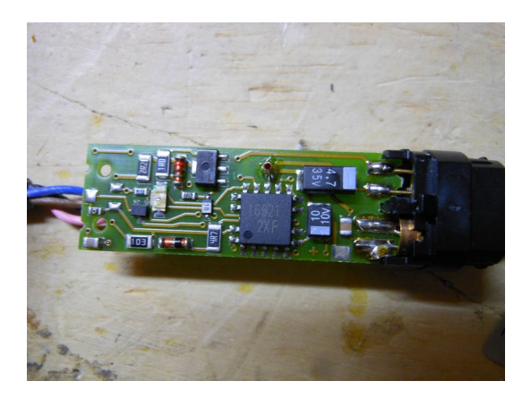
Figure 7: Omrom 'Photoelectric' IR Emitter and Receiver Pair. Notice the two diodes behind the black cover on the right side. After finding some documentation on these in the reviews, I found out that the IR emitters require a reflective sticker in order to 'see' their IR beam reflect back. Not just a white surface, but the type of reflector you might see on a construction or night worker orange vest.

Hookup Instructions from All Electronics Comments: