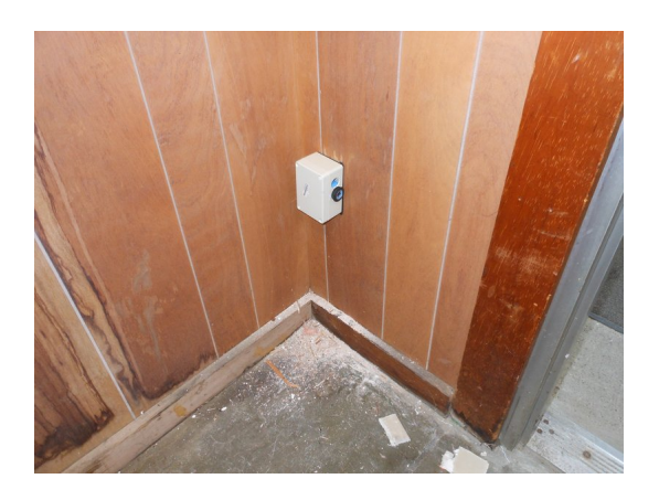
Figure 5: Part 1 of sensor. By mounting it on the right side of a project box, we can get a 90 degree angle.