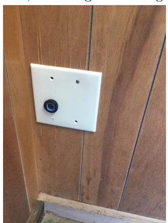
Figure 6: Arduino and Part 2 of sensor. Lined up with the other part.