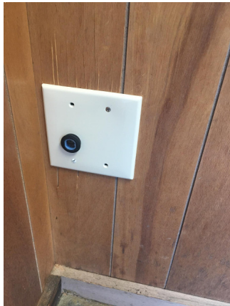
Figure 6: Arduino and Part 2 of sensor. Lined up with the other part.