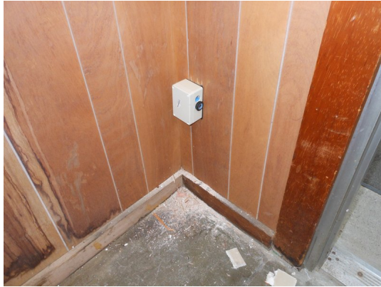
Figure 5: Part 1 of sensor. By mounting it on the right side of a project box, we can get a 90 degree angle.