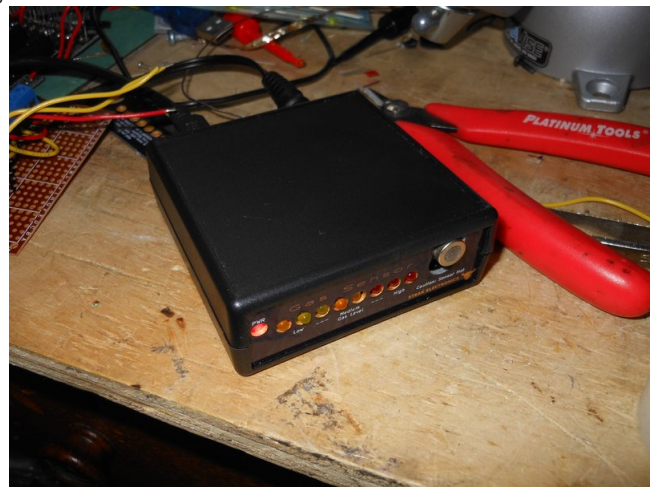
Figure 3: Prototype

In search of a low part count, simple to deploy switcher I came across this in my rss (https://hackaday.com/2019/08/11/switching-over-to-smps-for-efficiency/). The LM2576 is easy enough to use instead of a lm317, and requires only a diode and inductor more. Here I need more power efficiency from the 12V input so that should work. A simple go-to switcher.