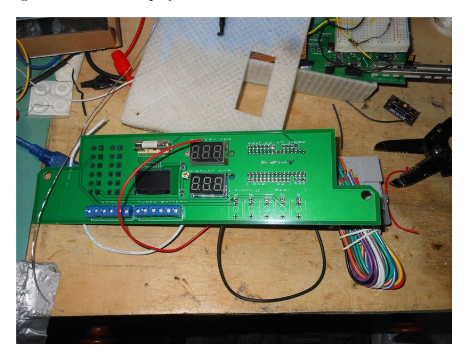
Figure 1: PCB rev 1

Replacing a car stereo. I could just go to ebay, and buy a used car stereo, but where's the fun in that? Let's DIY a car stereo from a PCB used as a frontplate, a connector for my vehicle, and an audio amplifier. I'll connect in signal from an audio player.