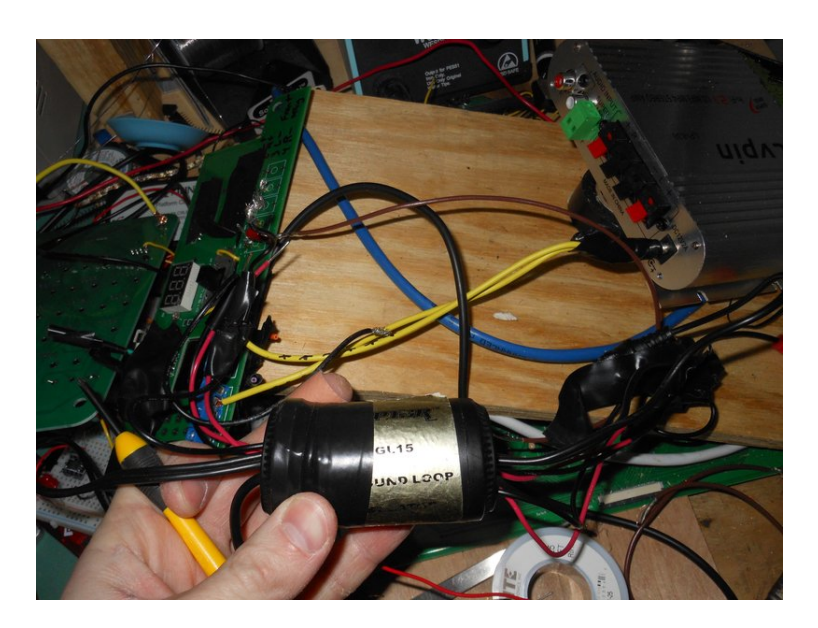
Figure 2: Ground Loop Isolator.

I had been given a Ground isolator, which was two small transformers on a pcb intended to pass audio from a car powered signal source into the car speakers. I tried this isolator on the output of the speakers, and while it worked, the volume was lower, and it was impractical. I knew as soon as I heard the volume, that the issue was an impedance matching problem. The transformers were too small. They were intended for signal sources, not amplifier outputs. Onto option #2.