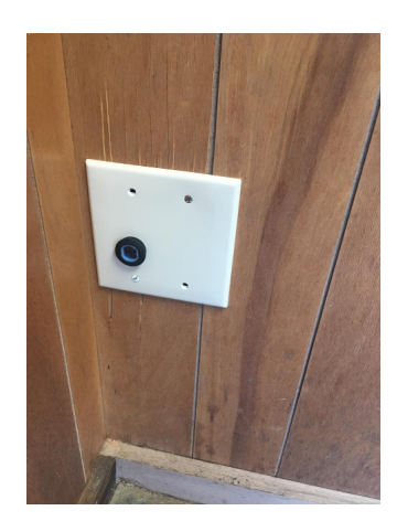
Figure 6: Arduino and Part 2 of sensor. Lined up with the other part.