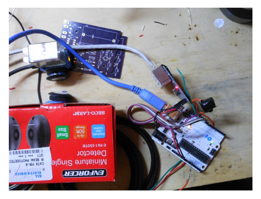
Figure 1: Testing the Sick IR Diode Tripwire

Figure 1 shows two things, first off a diode connected in series with the output of the Sick sensor, and also the orange LED on the top of the sensor. The orange led will be green when there is no connection between the diodes and orange when the Diodes (or LEDs) are lined up correctly. When someone moves across the field of their vision, the orange LED will change to green.<sup>1</sup>