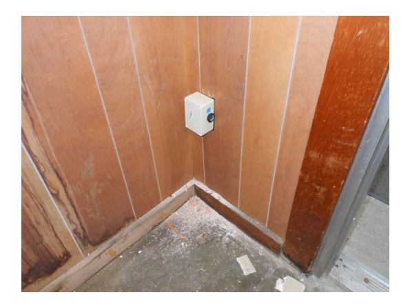
Figure 5: Part 1 of sensor. By mounting it on the right side of a project box, we can get a 90 degree angle.