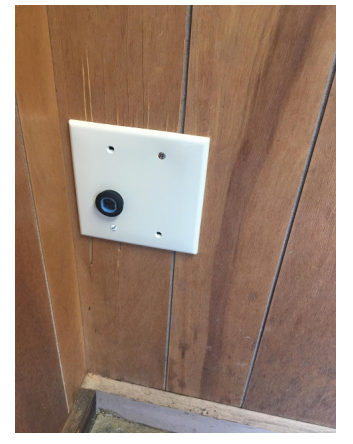
Figure 6: Arduino and Part 2 of sensor. Lined up with the other part.