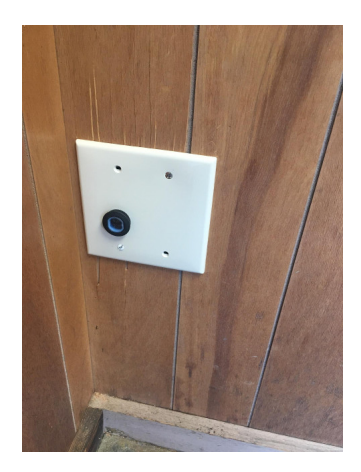
Figure 6: Arduino and Part 2 of sensor. Lined up with the other part.