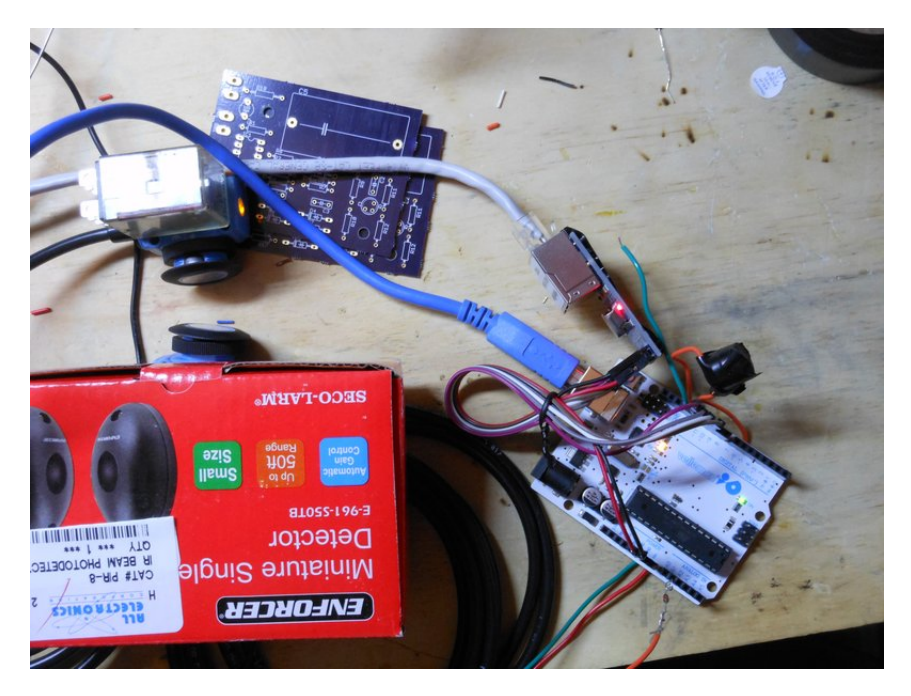
Figure 1: Testing the Sick IR Diode Tripwire

Figure 1 shows two things, first off a diode connected in series with the output of the Sick sensor, and also the orange LED on the top of the sensor. The orange led will be green when there is no connection between the diodes and orange when the Diodes (or LEDs) are lined up correctly. When someone moves across the field of their vision, the orange LED will change to green.<sup>1</sup>