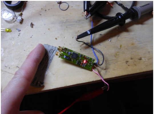
Figure 8: IR in action. (without a reflective sticker, it doesn't go very far!)

One thing I also noticed, was that used photo electric sensors from brand names can be obtained for discounts on the auction sites, to see if a good deal can be had. When buying them new, they can be relatively expensive for a hobbyist working out of his/her garage.