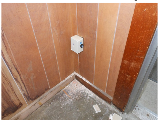
Figure 5: Part 1 of sensor. By mounting it on the right side of a project box, we can get a 90 degree angle.