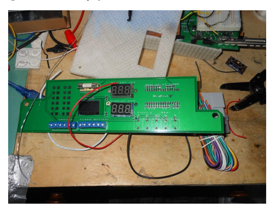
Figure 1: PCB rev 1

Replacing a car stereo. I could just go to ebay, and buy a used car stereo, but where's the fun in that? Let's DIY a car stereo from a PCB used as a frontplate, a connector for my vehicle, and an audio amplifier. I'll connect in signal from an audio player.