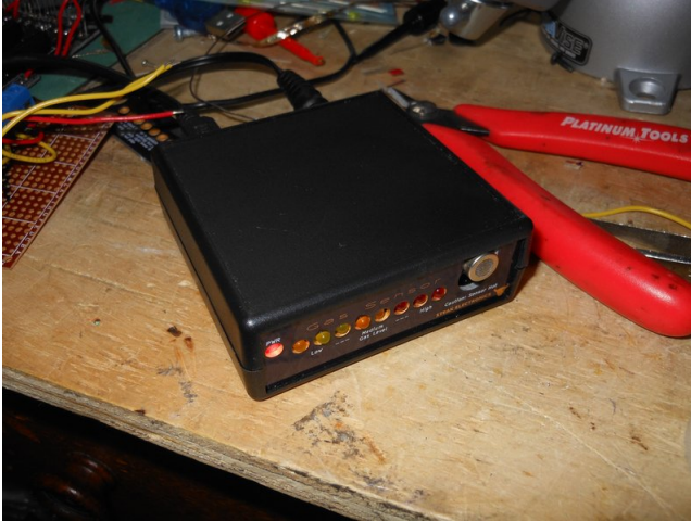
Figure 3: Prototype

In search of a low part count, simple to deploy switcher I came across this in my rss ( https://hackaday.com/2019/08/11/switching-over-to-smmps-for-efficiency/ ). The LM2576 is easy enough to use instead of a lm317, and requires only a diode and inductor more. Here I need more power efficiency from the 12V input so that should work. A simple go-to switcher.