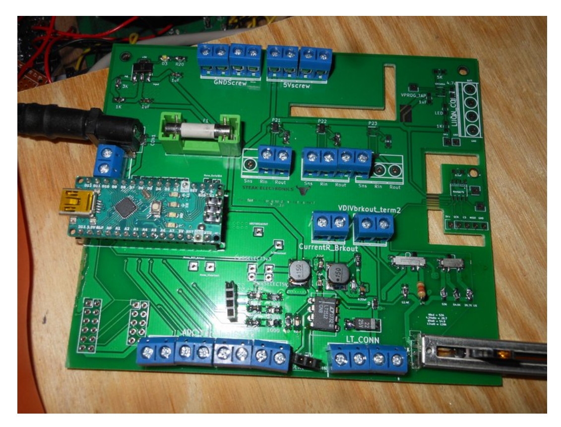
Figure 3: Rev 2

I guess I forgot a voltage divider on this board. I'll need at least 2 or 3 pins on the ADC to be 10%, so that I can measure 6 and 12v lead batteries. Hmph. For rev 2 I guess.