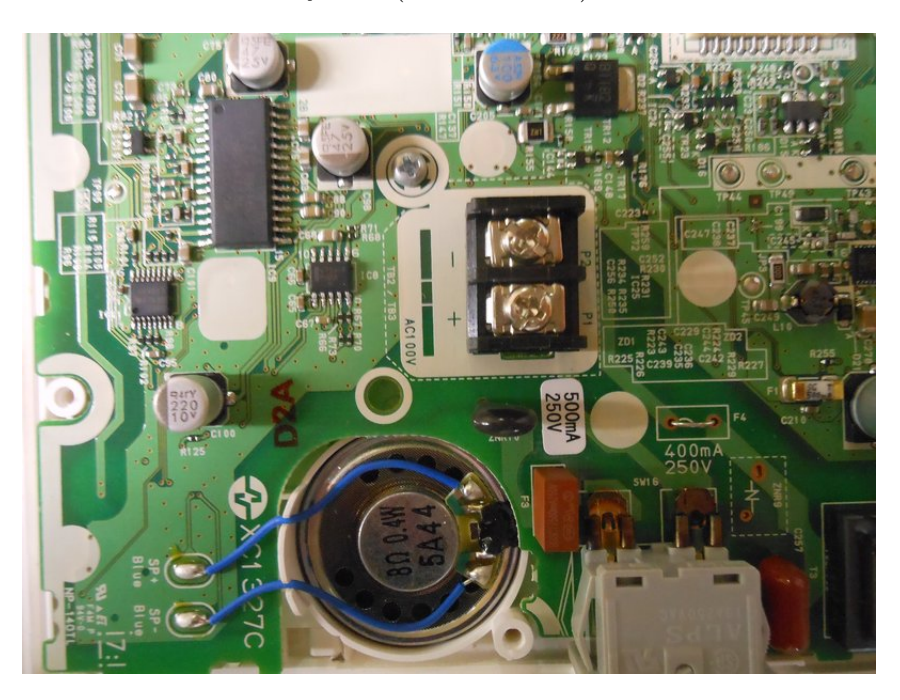
Figure 4: Barrier Strips that are PCB mount are stronger than terminal blocks.

The ones I have are flimsy. Next time I will use Barrier Strip that are pcb mount. These should be more sturdy and usable. See the AIPhone teardown for what they use. (Picture below).