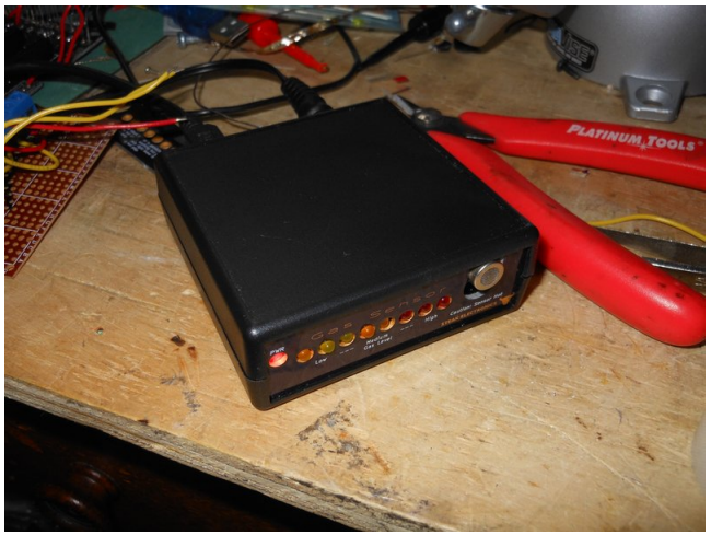
Figure 3: Prototype

In search of a low part count, simple to deploy switcher I came across this in my rss (https://hackaday.com/2019/08/11/switching-over-to-smps-for-efficiency/). The LM2576 is easy enough to use instead of a lm317, and requires only a diode and inductor more. Here I need more power efficiency from the 12V input so that should work. A simple go-to switcher.