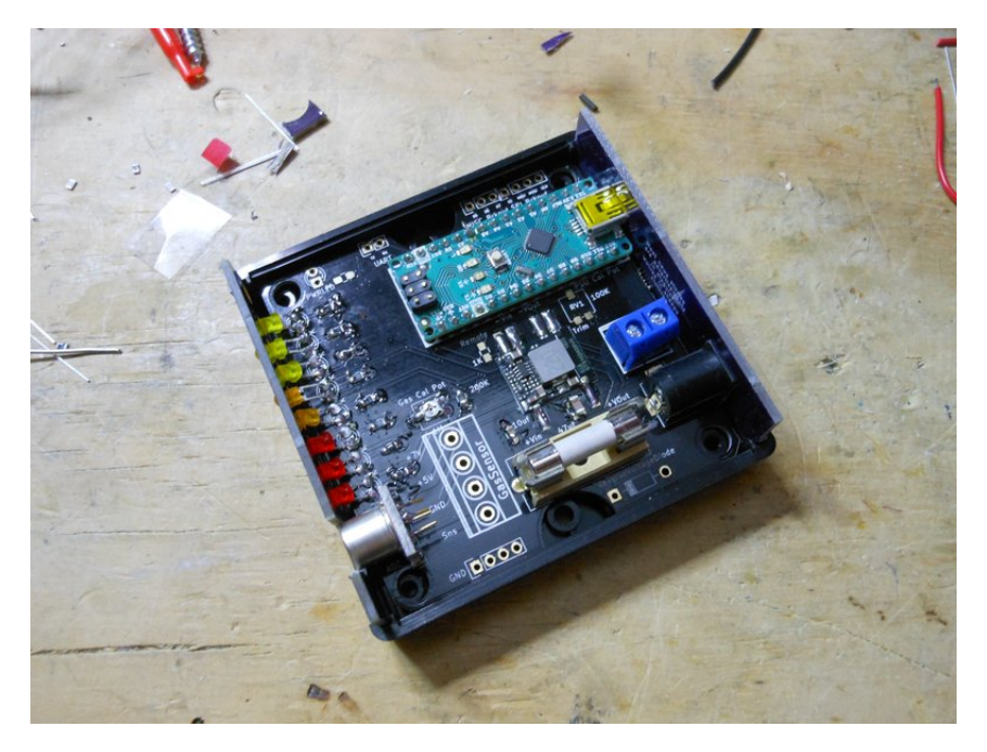
Figure 4: A simple solution.