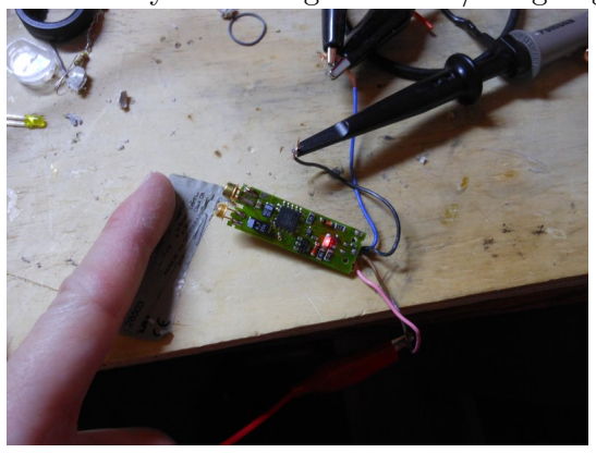
Figure 8: IR in action. (without a reflective sticker, it doesn't go very far!)

One thing I also noticed, was that used photo electric sensors from brand names can be obtained for discounts on the auction sites, to see if a good deal can be had. When buying them new, they can be relatively expensive for a hobbyist working out of his/her garage.