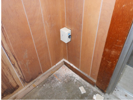
Figure 5: Part 1 of sensor. By mounting it on the right side of a project box, we can get a 90 degree angle.