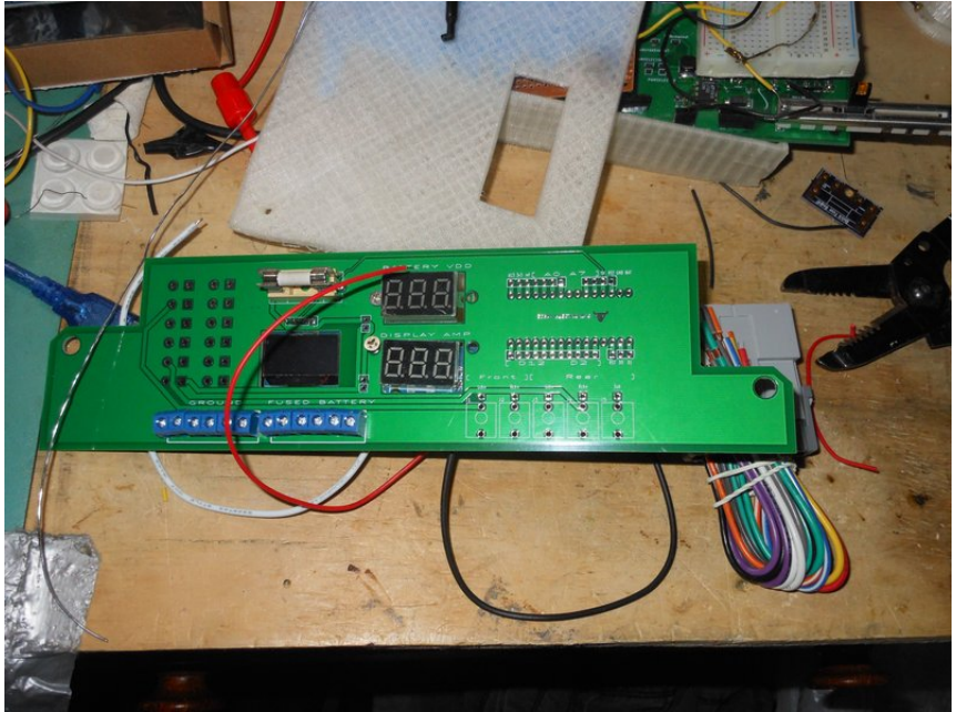
Figure 1: PCB rev 1

Replacing a car stereo. I could just go to ebay, and buy a used car stereo, but where's the fun in that? Let's DIY a car stereo from a PCB used as a frontplate, a connector for my vehicle, and an audio amplifier. I'll connect in signal from an audio player.