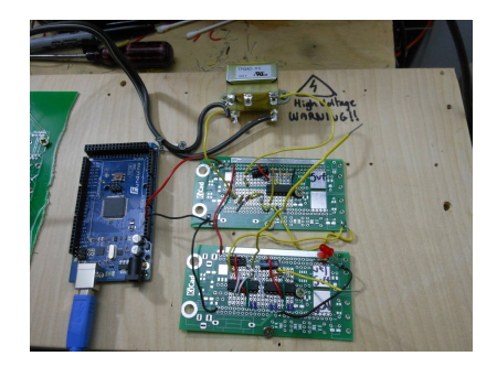
Figure 1: 60 Hz Logic Divider to 1Hz

The goal is relative accuracy. Not absolute. No GPS here. I'm going from 60 to 6,000 cycles.<sup>1</sup> This is just meant to be fun.