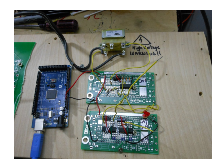
Figure 1: 60 Hz Logic Divider to 1Hz