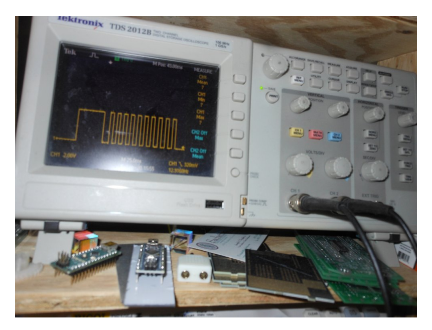
Figure 5: With a _delay_ms, there is no ramping up. But, the delay had to be a minimum, otherwise some ramping did occur. It's very slow, but usable for things without a lot of data to transmit.