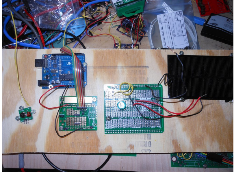
Figure 3: RF Transmitter w/ PCB Rev 4

I will start with two Radiocraft modules. Let's see how that plays out.<sup>10</sup>