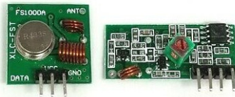
Figure 1: simple rx tx on 433mhz

I've bought some of these, and will do some testing.