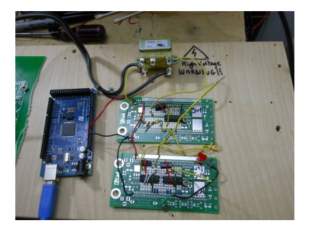
Figure 1: 60 Hz Logic Divider to 1Hz

The goal is relative accuracy. Not absolute. No GPS here. I'm going from 60 to 6{,}000 cycles. This is just meant to be fun.