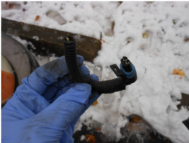
Figure 1: Cut off the connector at one end, so I can attach wires to it. This is what connected to the transmission