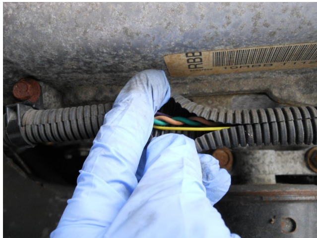
Figure 3: Further up the wire sleeve, where the wires are not chewed. Here I can cut them and solder new wires in. There are four wires here, as the sleeve was used for multiple wires.