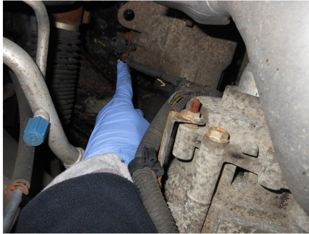
Figure 2: Wires visibly chewed here