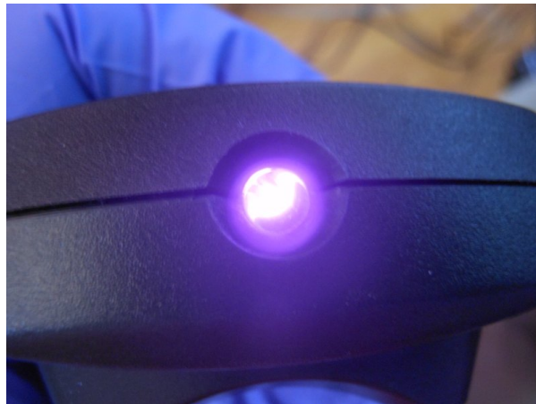
Figure 5: IR is normally invisible, however my digital camera picks it up. A Quick way to test IR is to take a picture. Alternatively, you can probe the diode leads with an oscilloscope.