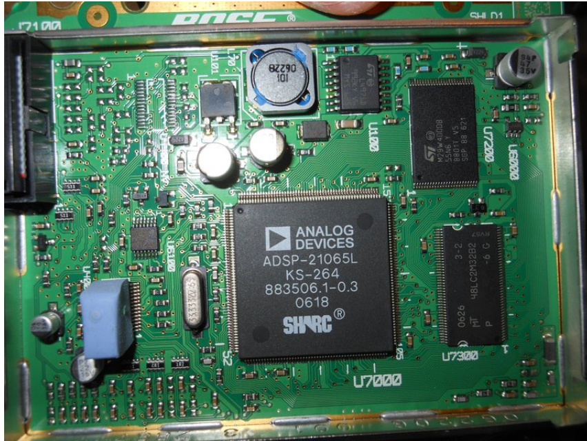
Figure 2: Main CPU board under can. Starting from 12 o'clock going clockwise, Linear and Switching power regulator, Flash, RAM, ADSP CPU (SHARC), ADC (under blue).

periods at boot. Based on data sheet, G is high and W down, when writes occur, separately G is down when reads occur. Write is pin 11. Write is normally high, and goes down briefly during boot up sequence (much less than the G pin). Based on all this, I suspect the flash is operating OK, without checking jtag.