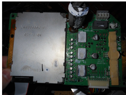
Figure 1: Main Board. CPU / ADC is under shield.

No visible damage inside. Power rails are all clean. Transformer outputs 22V AC. There is a switcher and a linear LDO Vreg both inside a can on the main board powering the ADSP (analog devices, in Woburn here) chip. The clock is OK. CLKIN and XTAL both have 33.33MHz clocks. No visible CLKOUT found. The board is reading external flash at boot, possibly, due to the appearance of such a chip. Checking pins of BMS and BSEL per ADSP data sheet... BMS is high, and BSEL is low, which means in data sheet... When BSEL is low, BMS and BSEL determine input. This appears to mean that BMS is an output, and its reading from external memory. There is a JTAG on the bottom of the board. I don't have the appropriate reader. There is a necessary delay after powering off the board, you have to wait for the caps to discharge, before powering back on. I found this by watching the Output enable pin of the flash on the scope (which seems to be working and apparently the flash is being read at bootup by the ADSP CPU). If you unplug power, and don't wait for the power to drop (about 5-10 seconds) it will not fully restart. The online docs say to wait one minute, hehe. That's why.