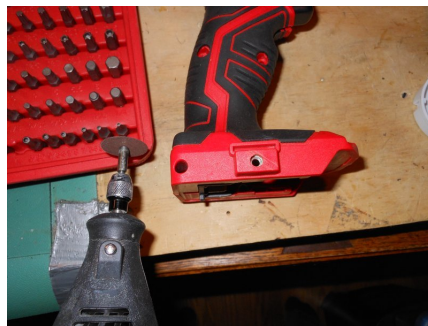
Figure 5: A dremel was used to help open the drill up, as I had not the required bit to open it (It required a longer torx driver than I had, so I opened up one of the drill inserts slightly).

Something for another day. Overall, it seems the FETs were woefully unprepared to actually ever power this drill. It was fundamentally flawed - broken from the day it left its overseas factory.