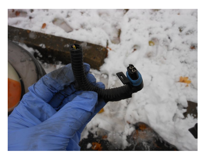
Figure 1: Cut off the connector at one end, so I can attach wires to it. This is what connected to the transmission