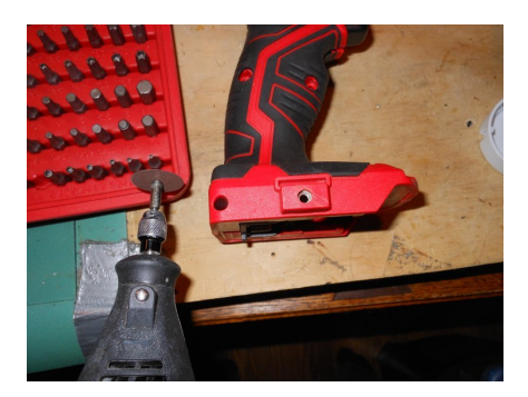
Figure 5: A dremel was used to help open the drill up, as I had not the required bit to open it (It required a longer torx driver than I had, so I opened up one of the drill inserts slightly).

Something for another day. Overall, it seems the FETs were woefully unprepared to actually ever power this drill. It was fundamentally flawed broken from the day it left its overseas factory.