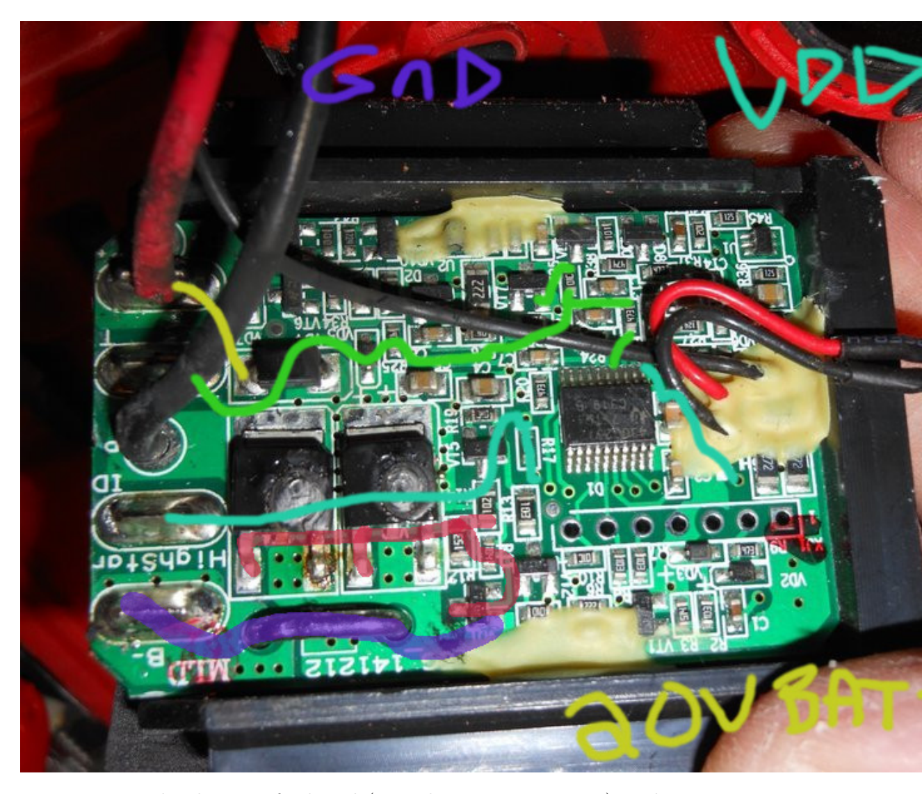
Figure 3: Rough schematic for board (see colour picture in repo). When switch is pressed, there is 20V on the tab of FET. I believe the FET must've overheated and shorted (perhaps counterfeit?). Though Right pin is to GND. Maybe it's a current limiter, not a FET, allowing Tab when V+ to be dropped down and current will flow. Too bad I wasn't able to stop using the drill before both FETs failed. I could've read one of them.