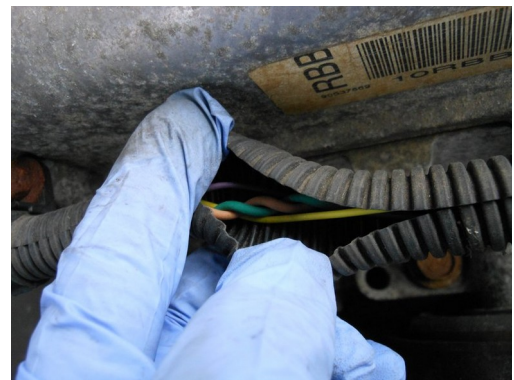
Further up the wire sleeve, where the wires are not chewed. Here I can cut them and solder new wires in.