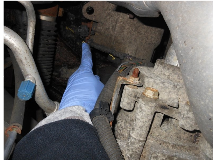
Wires visibly chewed here. They connect to transmission. Two wires, yellow and purple.