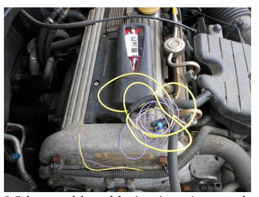
With portable soldering iron (portasol butane powered) and some wire, this is an easy fix. A little scary, though – being close to the gas line. Even if gas burns not explodes I don't want that to happen to my car.