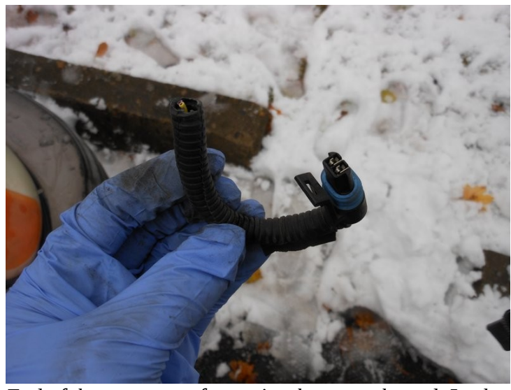
End of the connector from wire that was chewed. Lucky for me, the connector was intact.