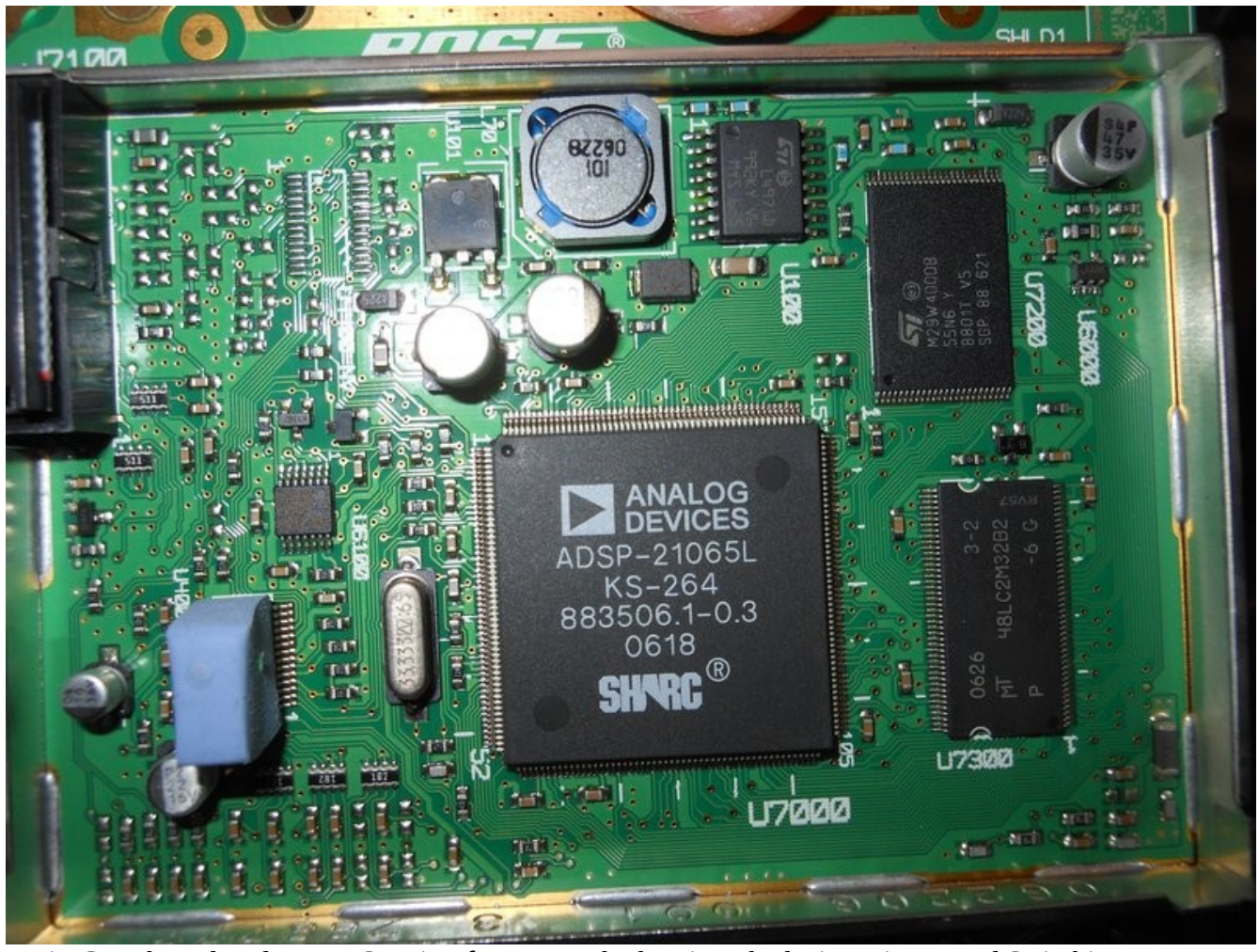
Main CPU board under can. Starting from 12 o'clock going clockwise, Linear and Switching power regulator, Flash, RAM, ADSP CPU (SHARC), ADC (under blue).

Pin DQ0 on the flash is constantly changing, in a set pattern. Perhaps flash is being accessed regularly? G (bus read) is normally high, but low during periods at boot. Based on data sheet, G is high and W down, when writes occur, separately G is down when reads occur. Write is pin 11. Write is normally high, and goes down briefly during boot up sequence (much less than the G pin). Based on all this, I suspect the flash is operating OK, without checking jtag.