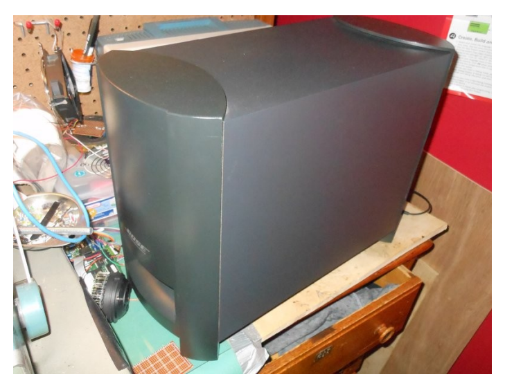
Bose Cinemate 1

Objective: Find out why Bose speakers don't work. User reports possible lightning surge caused damage to device.