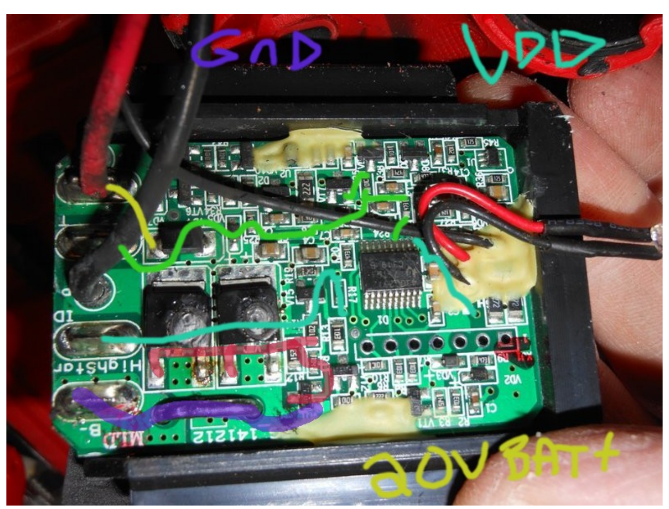
Board. When switch is pressed, there is 20V on the tab of vreg. I believe the VReg must've overheated and shorted (perhaps counterfeit?). Original device must've been an adjustable vreg, per the resistors on the red line for adj. pin. Pin out is Tab = VIN, Left pin = Adj, ? Though Right pin is to GND. Maybe it's a current limiter, not an adjustable Vreg, allowing Tab when V+ to be dropped down and current will flow. In that respect, maybe these are power transistors. Not Vregs.

NOTE: ADC10 pin functions are available only on MSP430G2x32.