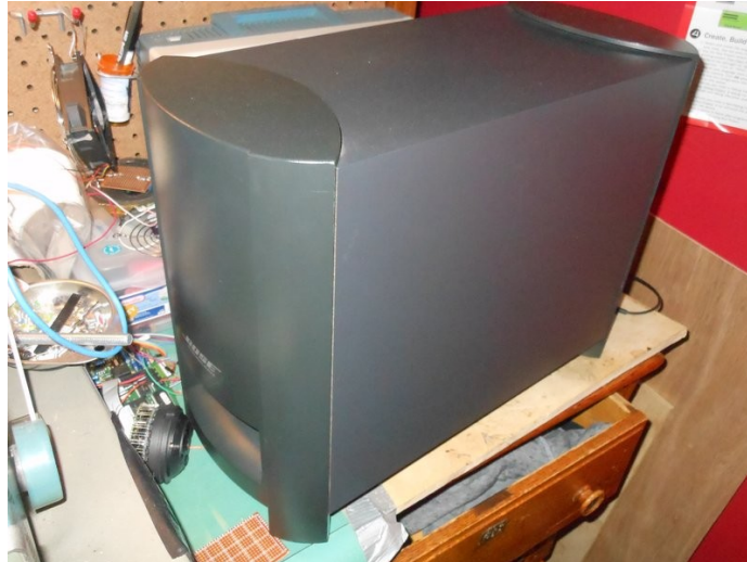
Bose Cinemate 1

Objective: Find out why Bose speakers don't work. User reports possible lightning surge caused damage to device.