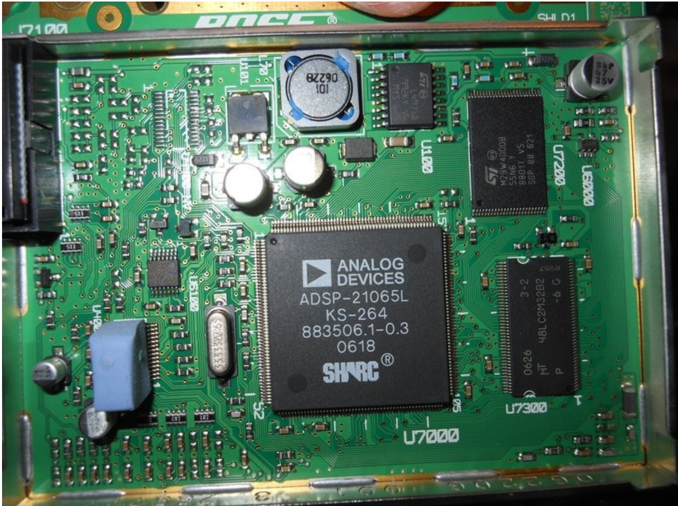
Main CPU board under can. Starting from 12 o'clock going clockwise, Linear and Switching power regulator, Flash, RAM, ADSP CPU (SHARC), ADC (under blue).

G (bus read) is normally high, but low during periods at boot. Based on data sheet, G is high and W down, when writes occur, separately G is down when reads occur. Write is pin 11. Write is normally high, and goes down briefly during boot up sequence (much less than the G pin). Based on all this, I suspect the flash is operating OK, without checking jtag.