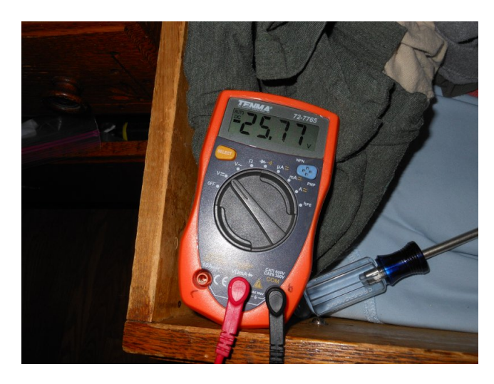
Figure 3: Fault. Later on I moved to a Fluke 27 for this, so please bear with the low quality \rm DMM

I looked around, and the output from the PWM is fed into a transformer, where it's rectified into a number of different voltages. The service manual tells all of this.