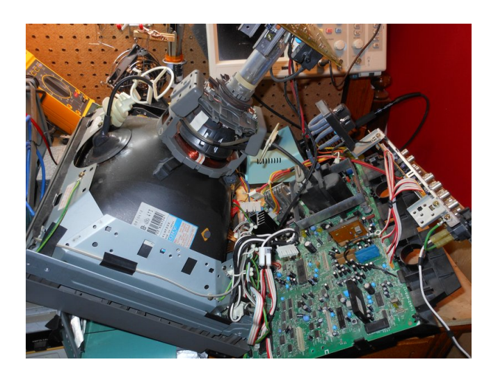
Figure 1: Barely User Service-able!