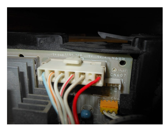
Figure 2: The Rail is listed as -15V...

I poked around a bit, but after a few minutes, remembered that voltages should always be checked somewhere early in the repair. Lucky for me, a -15v voltage is showing -25 volts. It being a negative voltage (in my limited knowledge) points to it being for an op amp, and op amps that don't have the right voltage might fail the H and V sync. I will try to fix that and hope there is no other damage.