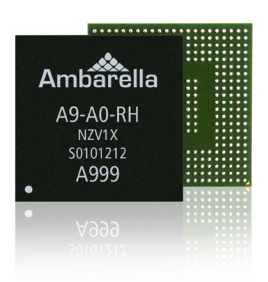
The 32 nm Ambarella A9 Ultra HD 4K SoC Device.

The A9 includes dual core ARM® Cortex<sup>™</sup>-A9 CPUs providing the performance required for advanced applications including wireless connectivity to smartphones for video streaming or image sharing.