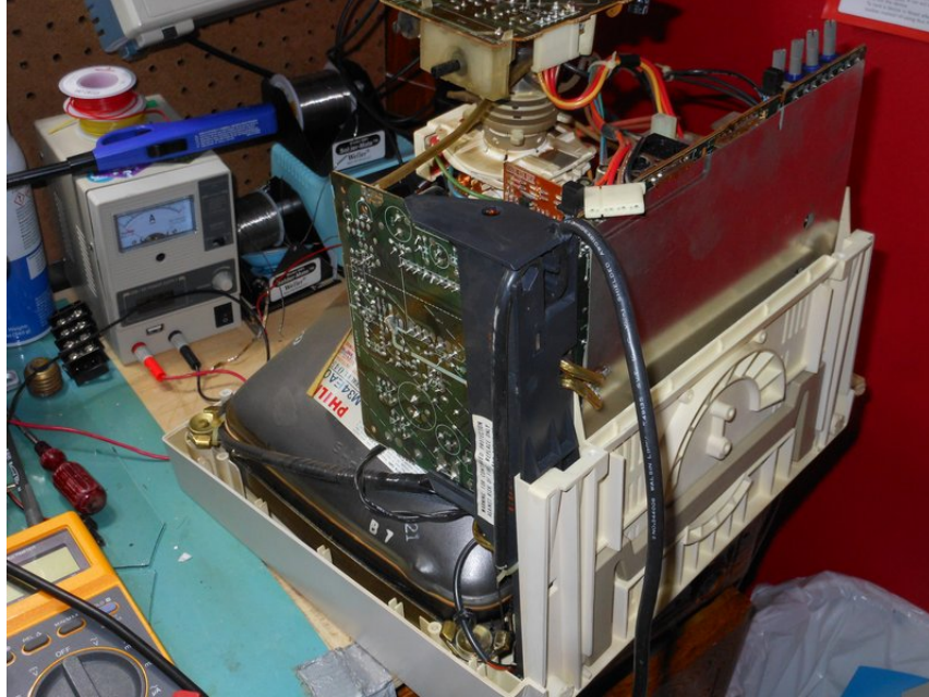
Figure 1: Commodore 1902A 14" CRT Monitor