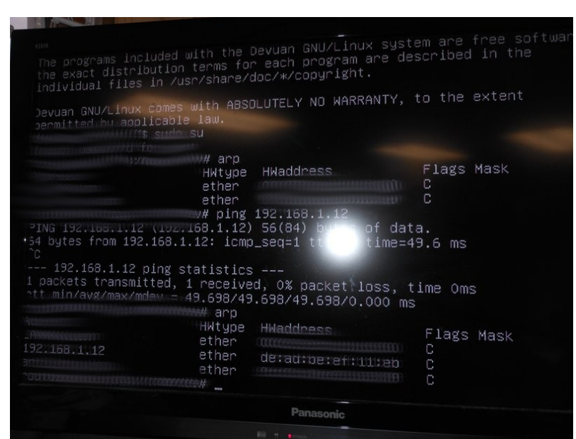
Checking the device is on the Camera LAN by pinging it, then reviewing the arp tables to make sure it's the right device (IP is static, so it's possible a conflict could arise)