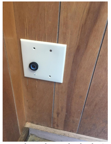
Here's how the outlet looks just before putting the final machine screws in. It was important to buy a "non breakable" wall plate (essentially a bendable more rubberized one), as the normal wall plate, simple shattered when drilled into. The non breakable version worked well with the drill.