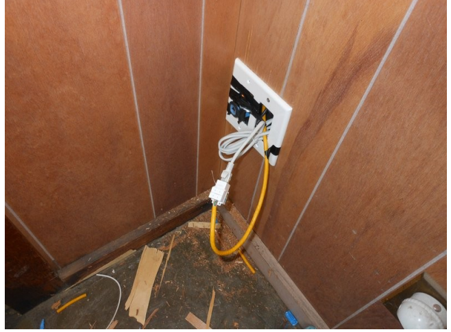
This mangled web of wires, is a temporary testing ground, while I go to the store to purchase a two gang blank plate. In this setup, I will calibrate the diodes to point correctly at each other by setting this double gang receiver diode to be fixed, and then adjusting the opposite laser diode. For testing though, some electrical tape, and the power wire pulled out will do temporarily. When the lights are off, the red diode light is more visible and may be easier to calibrate.