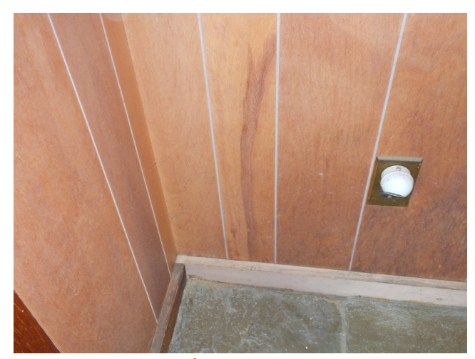
Choosing location for the sensors. Keep in mind, that the laser diode path must remain open. This is where the main board and sensor will be.