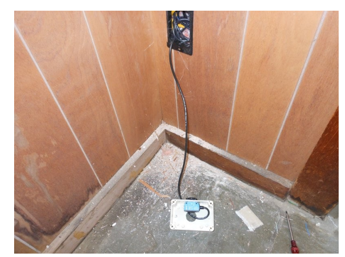
Installing the single sensor. I used ethernet as the power line. I also used a passive PoE adapter on both sides to transfer the power onto the ethernet, and back out to a 5.5, 2.1mm barrel plug