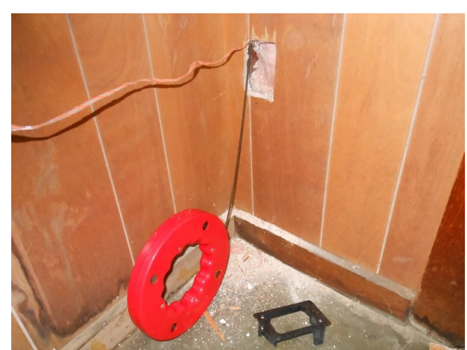
Feeding nylon string, and a wire up from the bottom of the wall to the ceiling. This is where the single sensor will be.