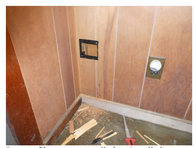
Low profile two gang wall plate installed.