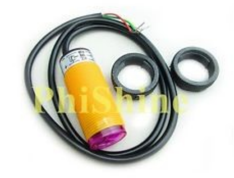
An example of a low cost photo electric sensor from ebay.

After finding some documentation on these in the reviews, I figured out why it wasn't working for me. These opto electronics absolutely require some type of reflector opposite them. Now, not all photoelectric sensors are like this, but this omrom model is. I've also purchased low cost ebay photoelectric sensors in the past, and those require no kind of reflector. Here is the review which details how to use the Omroms: